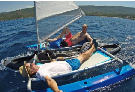
PEDAYAK TRIO & sail